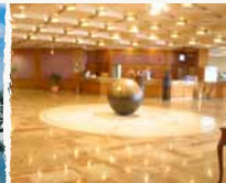
Crown Plaza, Jerusalem