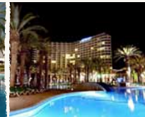
Le Meridien, Dead Sea