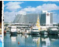
Crown Plaza, Eilat