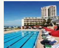
Sharon Hotel, Herzliya

Flights - (BA from Heathrow Terminal 5) 8 June 2012 BA 165 LHR - TLV 08.30 - 15.25 17 June 2012 BA 164 TLV - LHR 17.25 - 20.50