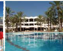
Gai Beach, Tiberias